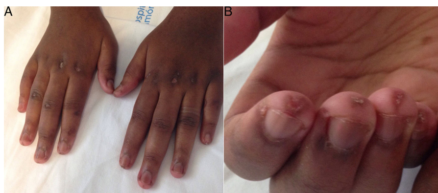
Fig. 1 – Dorsal aspect of the patient’s hands showing diffuse edema to middle phalanges, hypopigmented macules of atrophic appearance in metacarpophalangeal and proximal interphalangeal joints and periungual erythema (A). On the palmar side there are scarring lesions on the finger pads (B).