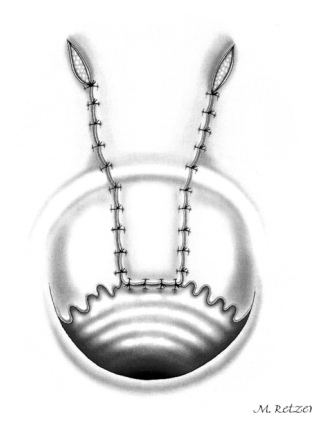
Figure 2 - Musiari's anoplasty. After an incision made in the fibrotic area, a rectangular flap is created and suturing to the line of resection is performed without tension.

Patients were discharged 48 hours after the procedure. A high-fiber diet combined with bulk laxatives was recommended