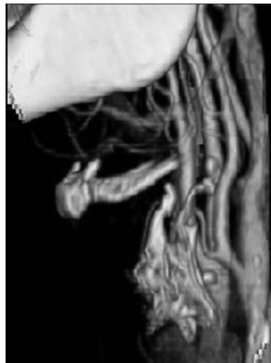
Figure 3. Three-dimensional reconstruction of the computed tomography taken 4 months after conclusion of the treatment protocol.

Correspondence: Dra. M. Hernando. Unidad de Otorrinolaringología. Hospital de Fuenlabrada. Camino del Molino, 2. 28942 Fuenlabrada. Madrid. España. E-mail: monicahernandoc@hotmail.com