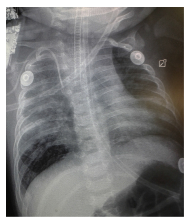
Figure 1 Anteroposterior (AP) x-ray of the chest. A bilateral reticulo-nodular pattern is observed with tendency towards consolidation in the right lung.

decompensated respiratory acidosis and placed on three phase ventilation. Diagnosis was made of multiple foci pneumonia and suspected TB. The mother's autopsy reported peritoneal TB.