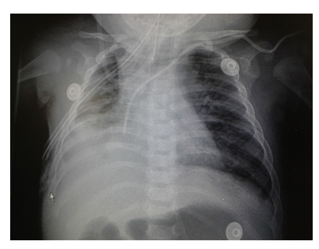
Figure 2 AP x-ray of the chest. A bilateral reticulo-nodular pattern is observed with right basal consolidation that effaces costophrenic and costodiaphragmatic angles.

Results of blood analyses upon admission were as follow: white cells 13,500, segments 24%, bands 1%, lymphocytes 47%, monocytes 9%, eosinophils 17%, platelets 355,000; VSG 5 mm/h; C-reactive protein (CRP) 2.09; total bilirubin (TB) 0.1 mg/dl; direct bilirubin (DB) 0.07 mg/dl; indirect bilirubin