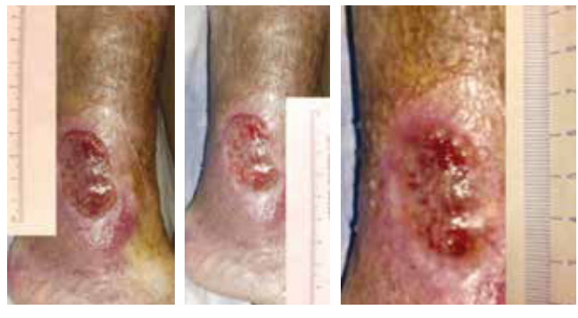
Week 1 (4 cm) Week 4 (3.6 cm)