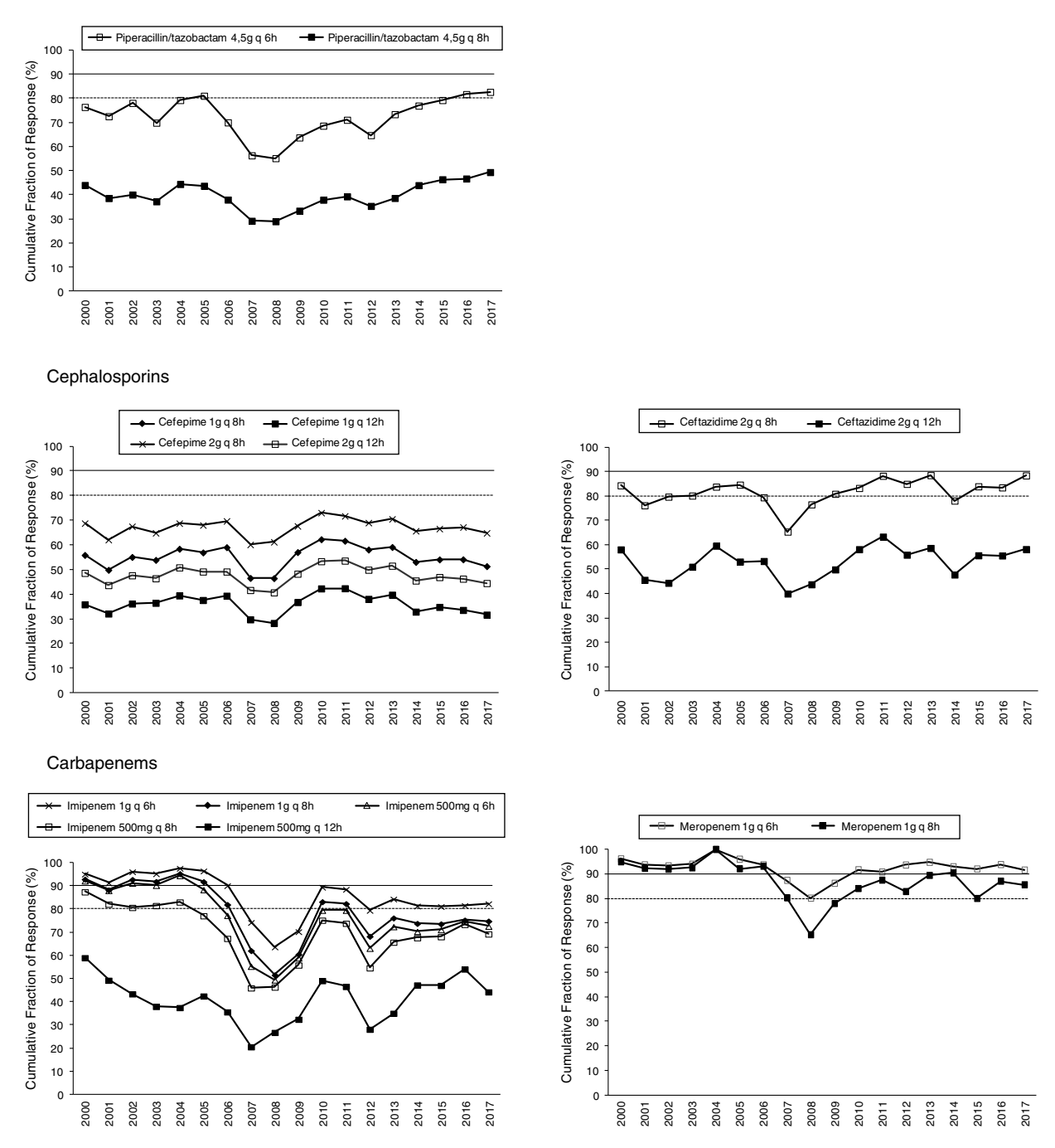
Fig. 1. Cumulative fraction of response (CFR) for standard dosage regimens of penicillins, cephalosporins and carbapenems.

despite being "susceptible" in the currently range, and proposed that the current CLSI criteria for cefepime susceptibility did not predict clinical outcomes appropriately and that the breakpoint of 8 mg/L is too high. In our study, if we calculate the susceptibility rate of P. aureginosa against cefepime considering 8 mg/L as resistant, the susceptibility rate decreases (for instance, in 2017 from 85% to 53%), and in this case, CFR values would match better their susceptibilities.