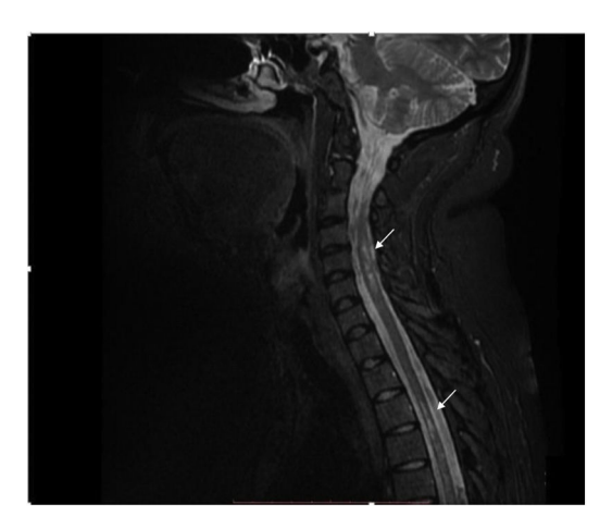
Fig. 2 – T2 sequence MRI showing hyperintense focal images at the level of the spinal cord located predominantly laterally with diffuse distribution in the cervical and thoracic spine (arrows).

inantly laterally and diffusely distributed in the cervical and thoracic spine on the T2 sequence (Fig. 2). The diagnosis of longitudinally extensive transverse myelitis in a patient with a history of juvenile idiopathic arthritis was considered.