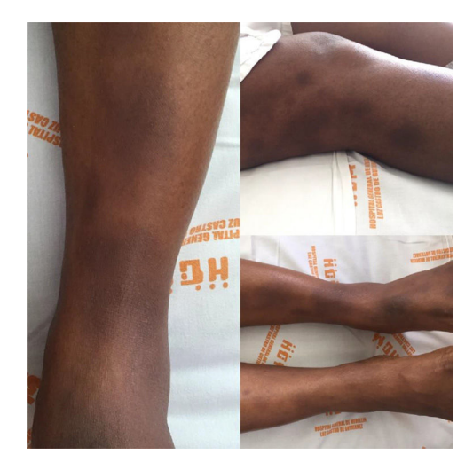
Fig. 1 - Multiple erythematous nodules in lower limbs which tend to coalesce.

In the paraclinical exams, the only relevant findings are a mediastinal widening observed in the chest X ray (Fig. 2), secondary to multiple adenopathies of paratracheal, right hilar and paraesophageal locations and in station 6, described in the chest CT scan (Fig. 3), and hypercalciuria corresponding to a value of 416 mg in 24 h. Other autoimmune processes are ruled out with negativity for anticardiolipin IgG and IgM antibodies, antinuclear antibodies (ANA), extractable nuclear antigen antibodies (ENA),