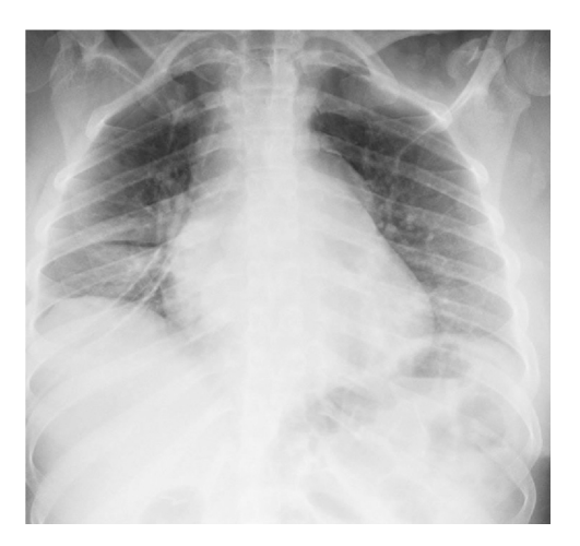
Fig. 2 - Mediastinal widening in chest X ray.