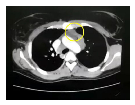
Fig. 3 - Solid lesion in the anterior mediastinum in relation to conglomerate of adenopathies.