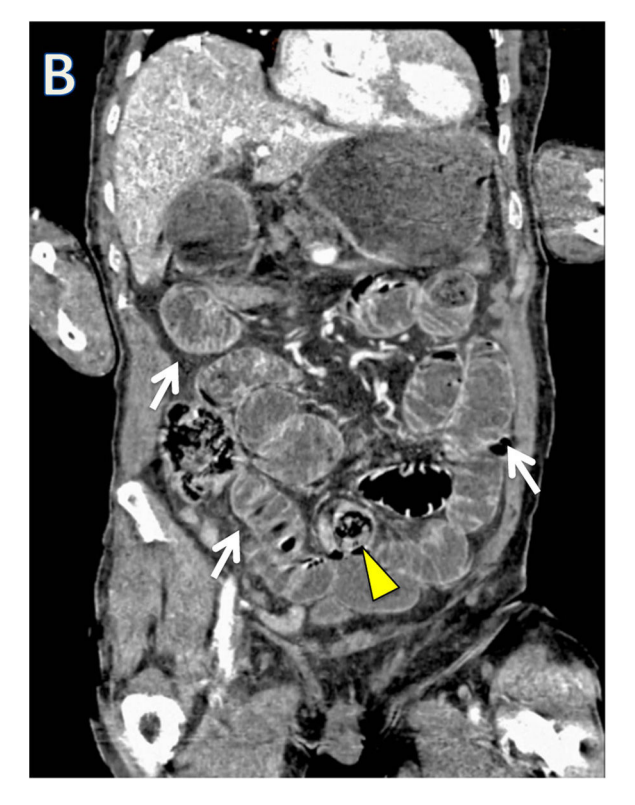
Figure 3 Abdominal CT axial and coronal showing small bowel loops distension (arrows) and an oval formation in a distal jejunal bowel loop.