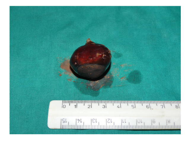
Figure 4 The foreign body (a chestnut) evacuated by the patient.

any therapeutic measure and, despite its size, passed the ileocecal valve that is frequent site of obstruction.