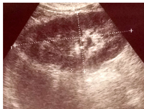
Figure 1 Ultrasonography imaging shows a hypoechoic 14 mm mass.

The differential diagnosis of a HIP is difficult. 3 On imaging studies a HIP can mimic a metastatic disease, primary liver cancer or a benign lesion. 4 Patients with HIP tend to be over 60 years old and more often (8×) men than women. There were several cases of exposure to industrial solvents,