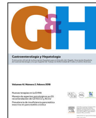
IMAGE OF THE MONTH