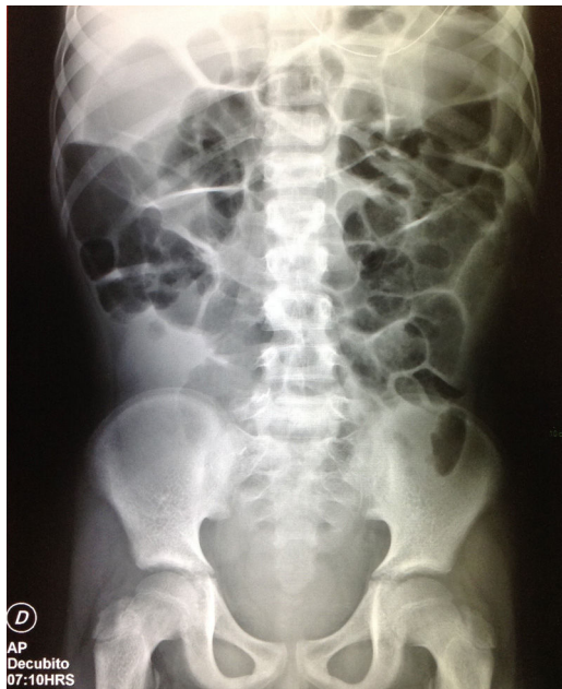
Figure 3 An abdominal AP supine radiograph. A decrease of the colon dilatation and small bowel gas is observed, but liquid in the topography of the ascending colon and rectum persists. A nasogastric tube is observed at the level of the epigastrium.

vation, vomit, and diaphoresis. In some cases, patients can present symptomatic bradycardia that may require atropine, or bronchospasm, for which a cardiorespiratory surveillance may be necessary, with vital signs and electrocardiogram up to 30 minutes after drug infusion. 1 Several contraindications to neostigmine include mechanical obstruction, evidence of ischemia or intestinal perforation, pregnancy, cardiac arrhythmias, severe bronchospasm, or renal insufficiency. 1 Hence, the importance of ruling out any signs of obstruction with an MRI, and checking that the transplanted kidney is functioning adequately. In pediatric patients, the use of 0.1 mg of neostigmine has been described, with increases of up to 0.05 mg every 20 minutes, until gastrointestinal motility recovery and a decrease of the abdominal distention or up to a maximum dose of 0.05 mg/kg 2 . In this patient, the maximal dose was nearly administered, 0.04 mg/kg, requiring three doses, which resulted in an obvious improvement both clinically and radiologically (Fig. 3), which was progressive so finally his discharge was decided.