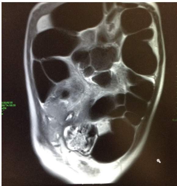
Figure 2 Magnetic resonance of the abdomen without contrast. Dilatation of the small and large intestine with abundant liquid and gas in its interior. Gas up to the zone of the rectum. No evidence of extraluminal fluid collections, or any signs of mechanical obstruction.

consultation with pediatric gastroenterology was solicited, who suspected an acute colonic pseudo-obstruction, for which 1.5 mg of neostigmine was administered, which decreased abdominal distention. Finally, an acute colonic pseudo-obstruction was diagnosed, for which two more doses of 1.5 mg of neostigmine were administered. During his hospital stay, the patient presented clinical improvement, with a progressive decrease in abdominal distention and symptoms, as well as a progressive improvement of oral intake. The patient was discharged in a good clinical state.