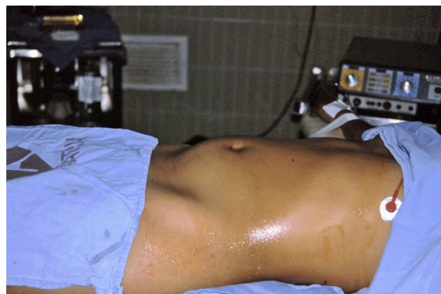
Figure 1 Abdomen distended due to right-sided paraovarian cyst.