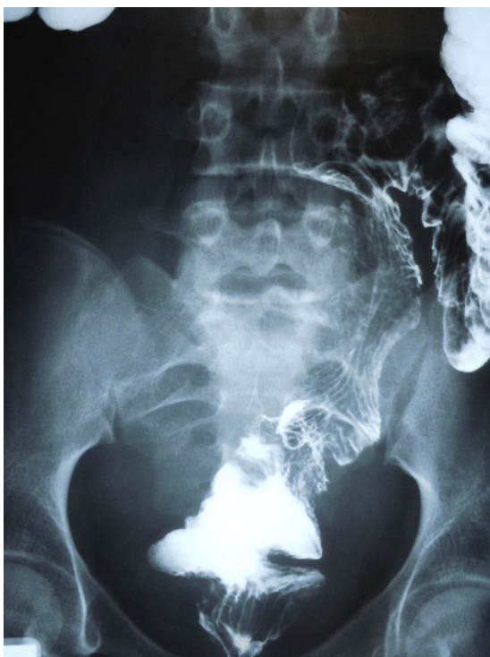
Figure 3 Displaced sigmoid colon.