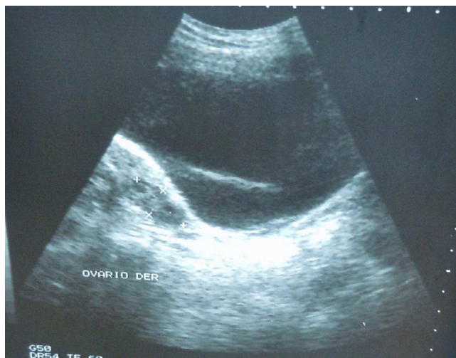
Figure 2 Paraovarian cyst with septum.

Shortly afterwards a laparotomy was performed under general anaesthetic with an infraumbilical transverse incision, revealing the right-sided tumour, compressing and displacing the uterus to the left. Immediately after opening the peritoneal covering the entire tumour was dissected