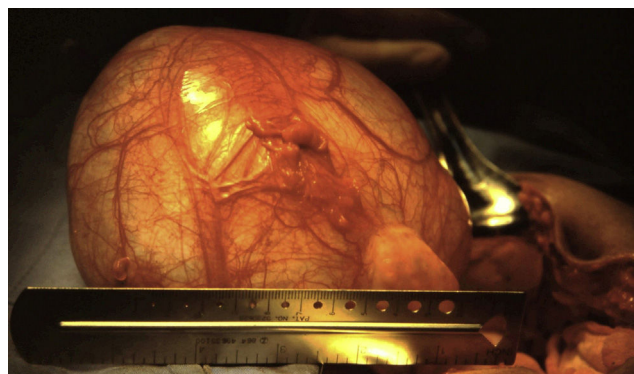
Figure 4 Upper part of the paraovarian cyst.