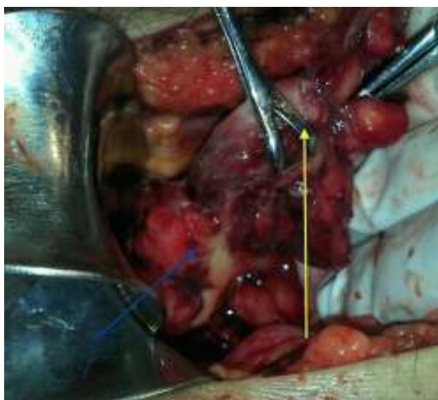
Figure 2 Perforation of the caecal appendix (perforation, right arrow; hernia sac, left arrow).

characteristics of incarcerated or strangulated inguinal hernia. Even an acute appendicitis or perforated appendix inside the hernia sac does not show specific signs and symptoms. For these reasons it is difficult to reach a clinical diagnosis of Amyand's hernia preoperatively. 3 Diagnosis takes place during the transoperative period, when surgical exploration is undertaken due to clinical signs of a complicated inguinal hernia.