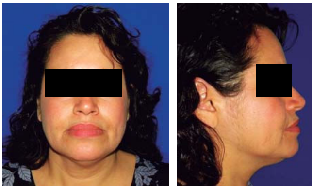
Figure 1. Initial facial photographs, frontal and profile views, where a depressed middle third may be observed as well as an increased lower third, brachifacial biotype and a concave profile: all characteristic of a skeletal class III.

After eight months of traction of the retained canines, it was determined by radiographic analysis