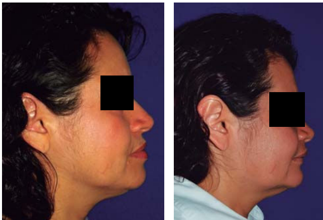
Figure 5. Pre-surgical (left) and post-surgical (right) profile photographs.

of difficult diagnosis and, prognosis, due to the complexity of situations that are present in this group of patients. Suggesting a multidisciplinary treatment in patients with these characteristics who have, in addition, dental limitations (dental absences, periodontal disease, etc.) is of great importance for achieving the objectives set out in a well designed therapeutic plan, as the orthodontics alone would not be capable of restoring dentofacial harmony and thus avoiding success and stability in the treatments. The case of the patient that is reported in the present article complies with this interdisciplinary approach, obtaining results that solve the initial problem and, in this way achieving improvement in dentofacial aesthetics and in function.