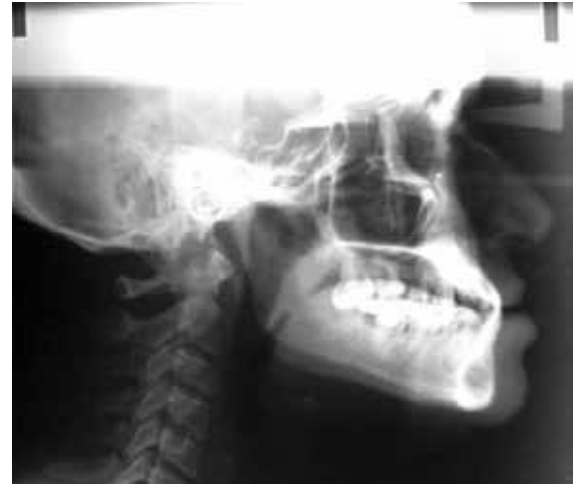
Figure 4. Initial lateral headfilm.

profile; canine guidance was achieved by means of prosthetics. Bilateral molar class I was also obtained as well as coincident midlines, improvement of the smile, a positive overjet and overbite, periodontal health and occlusal function.