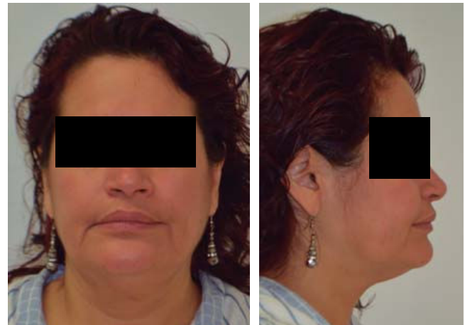
Figure 7. Frontal and profile final photographs.