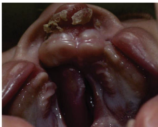
Figure 9. Initial intraoral photography.