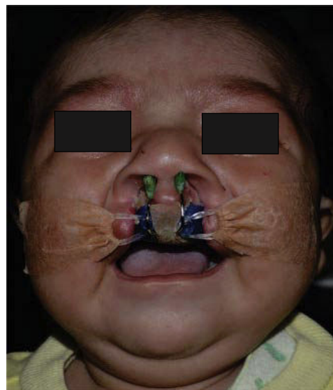
Figure 10. Intermediate photography.

It was not until 1999 that Grayson 10,11 described the nasoalveolar molding technique which was very