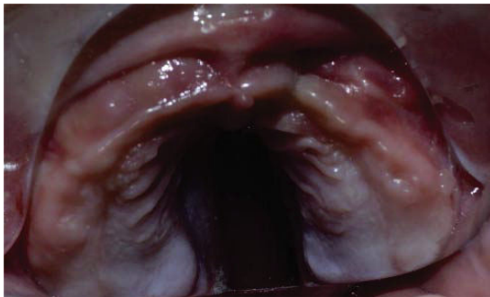
Figure 14. Final intraoral photograph.