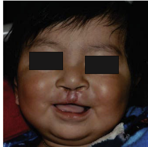
Figure 15. Final photograph.