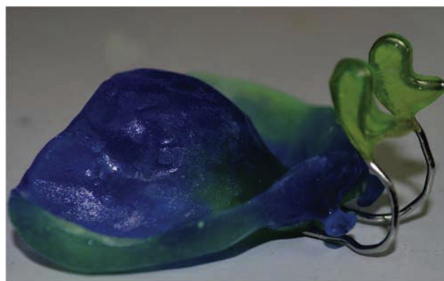
Figure 11. Nasal shaper.