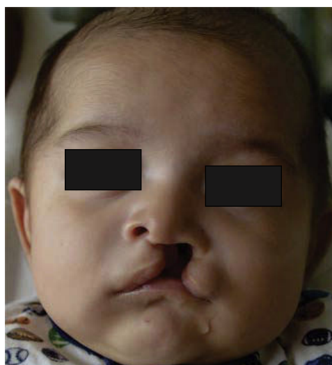
Figure 6. Patient before cheiloplasty.

Duration of treatment with pre-surgical orthopedics in the first case was eight weeks ( Figures 12-14 ) and in the second case, 16 weeks ( Figures 15 and 16 ). Adequate formation of the alveolar process, elongation and improved symmetry in the columella, stimulus for cleft palate closure was achieved as well as a better tone of the perioral muscles thus favoring a good surgical tissue management and achieving lip closure without tension with good functional and aesthetic results.