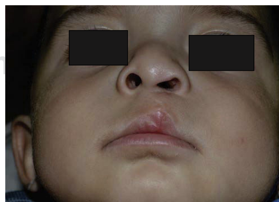
Figure 12. Nasal domes view.