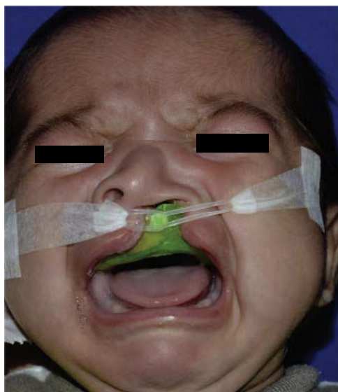
Figure 4. Intermediate photography.

The patient's mother signed an informed consent where the diagnosis, treatment plan and possible complications were specified. Treatment plan consisted in obtaining an impression with condensation silicone to make a Friedman obturator that would align and retrude the premaxilla using as auxiliary extraorally attached tapes placed at 45° so that they would exert a force direction and intensity suitable for that purpose.