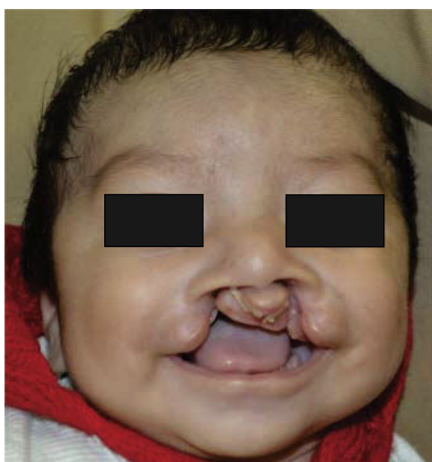
Figure 8. Initial extraoral photography.