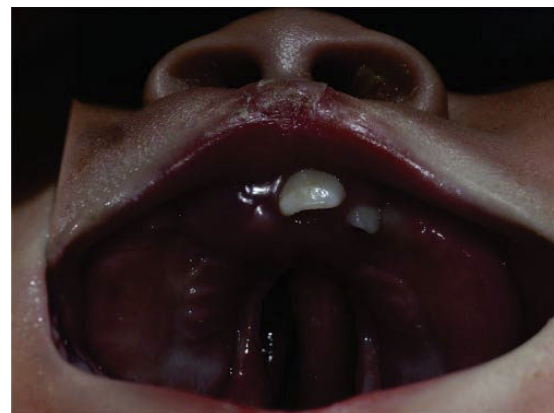
Figure 16. Final intraoral photograph.

well accepted since it offered a new alternative for patients in the neonatal period, prior to the execution of the first surgery of the lip and nose. In the literature, several successful results are reported since it shapes adequately the wing of the nose and provides a more aesthetic and functional way of shaping and changing the position of the immature and malleable nasal cartilage thus lengthening the columella. 12,13