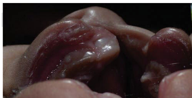
Figure 3. Initial intraoral photography.