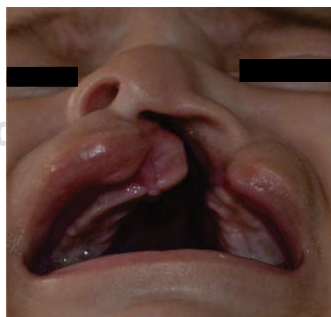
Figure 7. Intraoral photography.