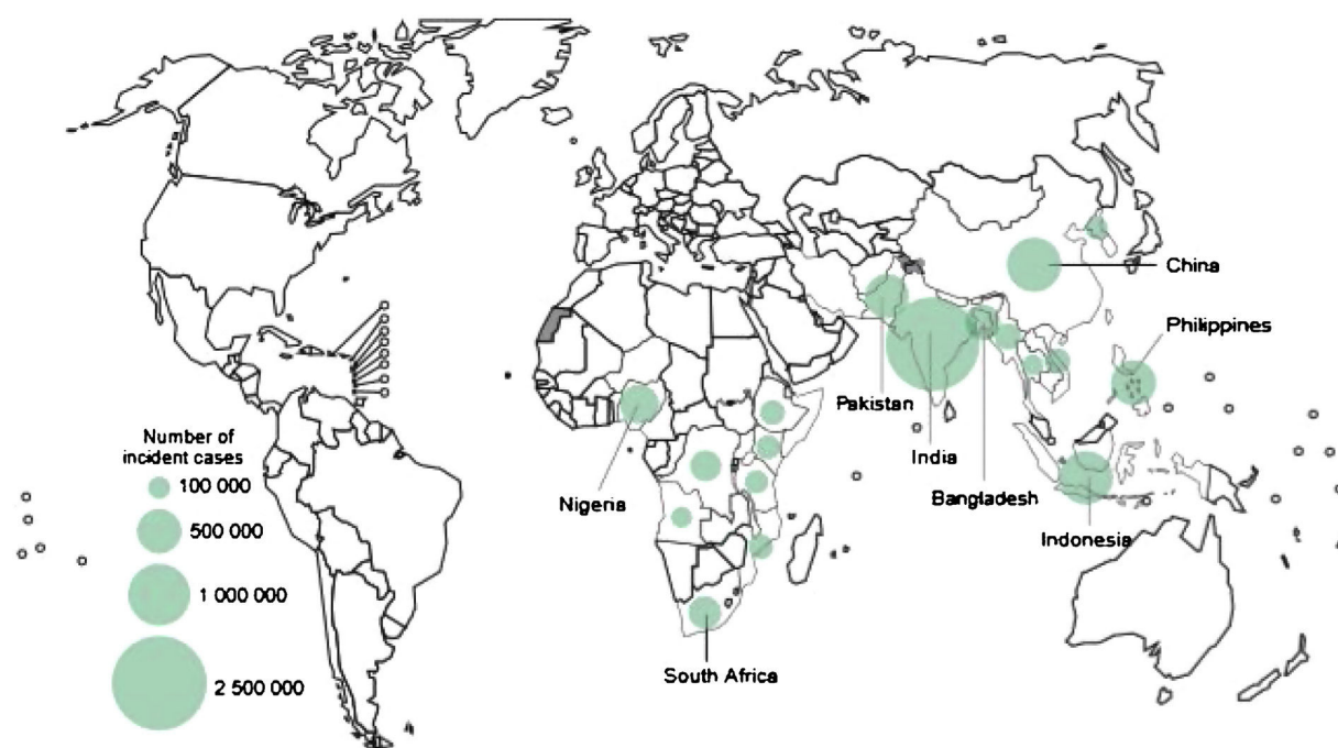
Fig. 1. Estimated incidence of TB in 2018, for countries with at least 100,000 incident cases. Source: Global Tuberculosis Report 2019. Geneva: World Health Organization; 2019. License: CC BY-NC-SA 3.0 IGO. Available in: https://www.who.int/tb/publications/global-report/en/ .

Initially, Mycobacterium tuberculosis , the aetiological agent of TB, causes Latent Tuberculosis Infection (LTI) and only a small proportion of these patients (5–10%) will develop the disease in their lifetime. The WHO considers that the main risk factors for this are malnutrition, HIV infection, alcoholism, smoking and diabetes 3 . Other diseases or immunosuppressive treatments and advanced age could also play a role.