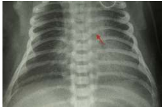
Figure 1 Intracardiac umbilical venous catheter in the left atrial region.

Soon after the procedure, the patient showed persistent tachycardia (190–230 beats per minute) and worsening of respiratory pattern, requiring tracheal intubation. Chest radiography showed normal cardiac area, clear lungs and intracardiac umbilical catheter in the left atrium region (Fig. 1), which was repositioned. The patient, however, persisted with tachycardia. An electrocardiogram was then performed, which confirmed the supraventricular tachycardia, suggestive of atrial flutter.