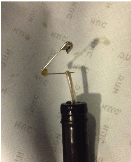
Figure 3 Safety pin secure with a polypectomy snare, after retrieval.

gently removed under direct visualization (Figs. 2 and 3). The procedure occurred without immediate complications and no evidence of pneumoperitoneum in the control X-ray.