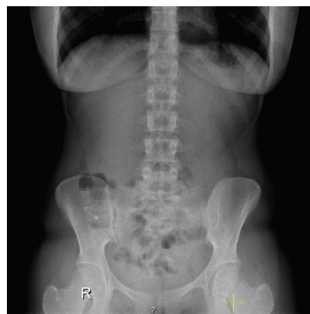
Figure 1 Plain abdominal radiograph showing an open safety pin.

surveillance and remained asymptomatic. She was maintained on a clear liquid diet. At the fifth day of hospitalization and after consecutive abdominal radiographs performed each day, the safety pin was persistently located at the right iliac fossa (Fig. 1). Because of the suspicion that the pin was impacted at the ileocecal valve and after retrograde preparation, a colonoscopy was performed. Adjacent to the valve it was observed a free and open pin that was carefully caught by its pointed tip with a polypectomy snare (SnareMaster Olympus®, 10 mm). Then it was