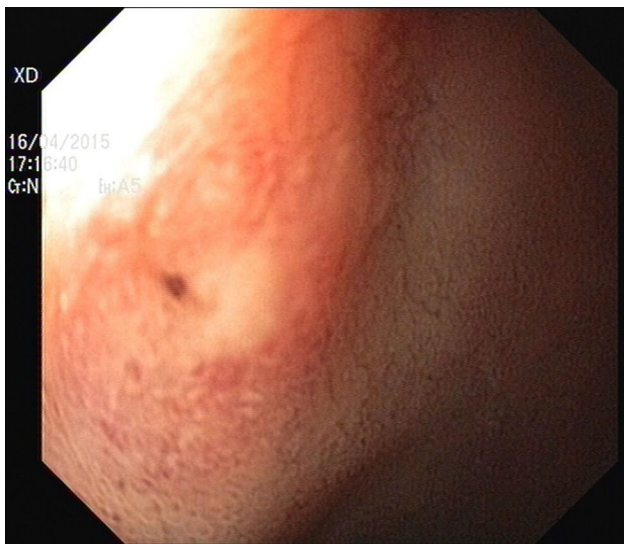
Figure 2 Fistulous opening in the antero-superior duodenal bulb wall.

the literature. The possible mechanism of the liver abscess secondary to fish bone migration from the duodenum it's the creation of a duodenohepatic fistula covered by duodenal serosa. 2 Since the first reported case, treatments usually