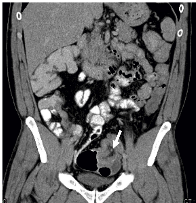
Figure 4 Abdominal CT (coronal view): lipomatous mass with 7 cm x 4 cm larger diameter in the.

The authors describe this case due to its rarity. Colonic lipoma is a very rare benign tumor, however it is the second most common benign tumor of the colon with an incidence between 0.2 and 4%. 1 In 90% of these cases the origin of the lipoma is confined to the submucosal layer. 2 It is more frequently found in the right colon by colonoscopy. These lesions are usually asymptomatic and do not require specific treatment. Lipomas larger than 4 cm, are considered giant and are symptomatic in 75% of cases. 3 Symptoms are usually abdominal pain, bleeding, colonic obstruction and intussusception. The intussusception is a rare complication that requires a differential diagnosis with a malignant lesion. Literature describes that lipomas larger than 2 cm should be removed due to colonic intussusception risk. 4