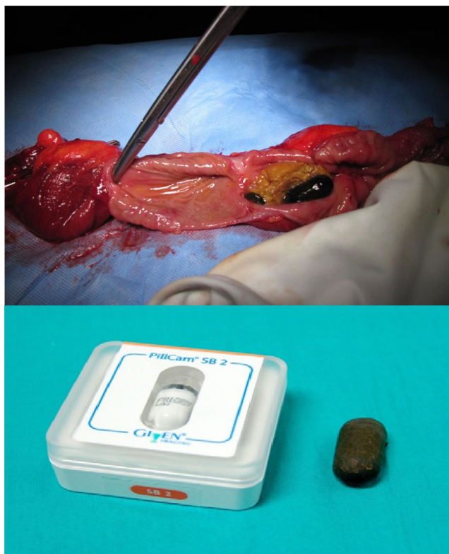
Figure 2 Segment of the resected small bowel containing the retained capsule.

The authors also reviewed the capsule study confirming that no stenosis was identified. Interestingly, the patient did not remember any abdominal symptoms during the 7 years of capsule retention.