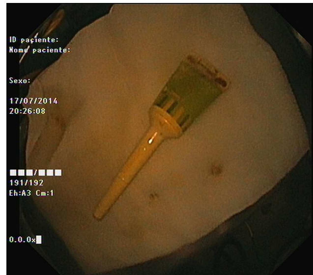
Figure 3 Extracted microenema device.

The authors have no conflicts of interest to declare.