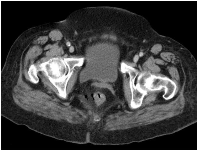
Figure 2 Computed tomography image showing perirectal air adjacent to the right rectal wall, suggesting perforation.