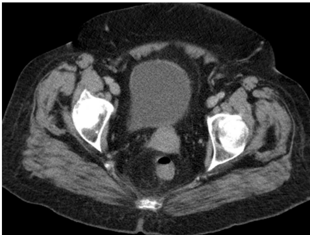
Figure 3 Computed tomography image showing increased densification of the right side of the Perirectal fat.

Confidentiality of data. The authors declare that they have followed the protocols of their work center on the publication of patient data.