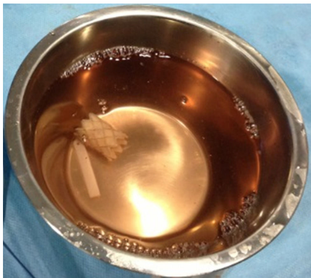
Fig. 2 – Melody ® pulmonary valve.

During tPVR, patient immobility is crucial. With the exception of arterial cannulation, it is not very painful. Some parameters should be defined to avoid oscillations in the level of sedation that can compromise the procedure. In our center, the pharmaceuticals generally used are propofol and remifentanyl in TCI, for a target BIS between 60 and 80, paying special attention to the arterial cannulation and the valve dilation and implantation. The use of capnography allows for both an early intervention based on the early detection of hypoventilation (loss of the quality of the curve or an etCO 2 > 50), thus improving the titration of the pharmaceuticals or the performance of maneuvers for opening the airways. In this way, it is possible to anticipate a desaturation that would require respiratory support and cause involuntary movement of the patient. This may include preventing excessive hypercapnia that would hinder the technique due to hypoxic pulmonary vasoconstriction. 8 Sedation, together with rSO 2 (to avoid reductions of more than 20% with respect to the patient's base values and an absolute value under 50%) 9 allows for closer neurological monitoring, given the risk of cerebral (stroke) events.