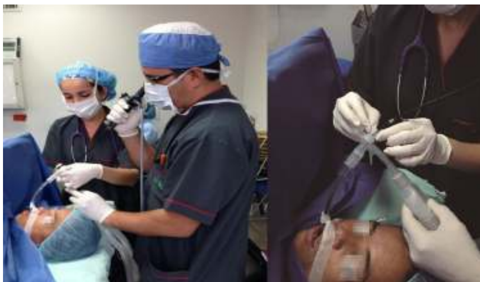
Fig. 2 – Measuring technique. Placement of adhesive tape (micropore), with direct and pre-determined distances.