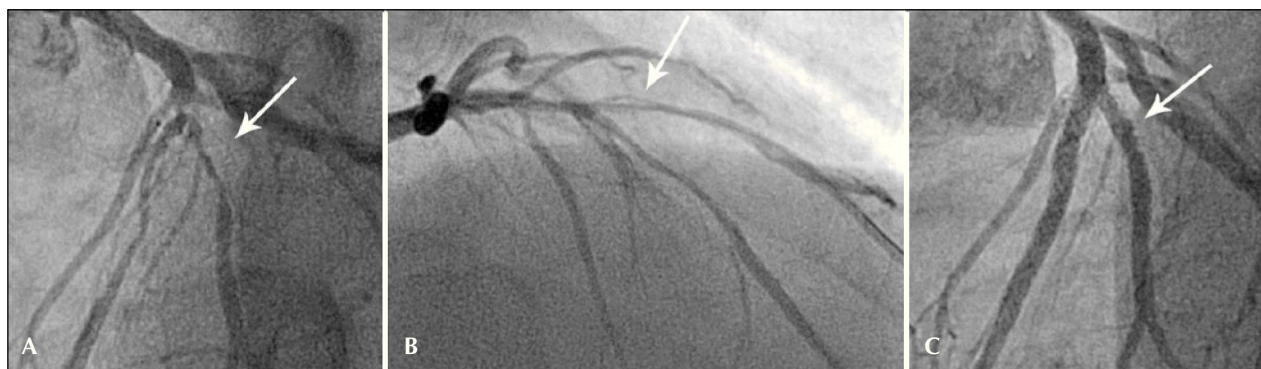
Figure 2 – Image of a ‘true’ coronary bifurcation lesion located in the proximal segment of the anterior descending artery (A), which showed dissection of the diagonal branch after predilation with a balloon-catheter (B), treated with a 2-stent (mini-crush) technique with good angiographic results (C).

side branch predilations had more extensive side branch lesions, a smaller minimal lumen diameter, and more severe obstruction compared with the side branches of the group with successful predilations. The multivariate analysis evaluated the presence of calcification, distal and proximal angles, eccentricity, lesion extension, reference vessel diameter, minimal lumen diameter, and stenosis diameter percentages. The only significant predictor of side branch predilation failure was the percentage of diameter stenosis at the ostium of the