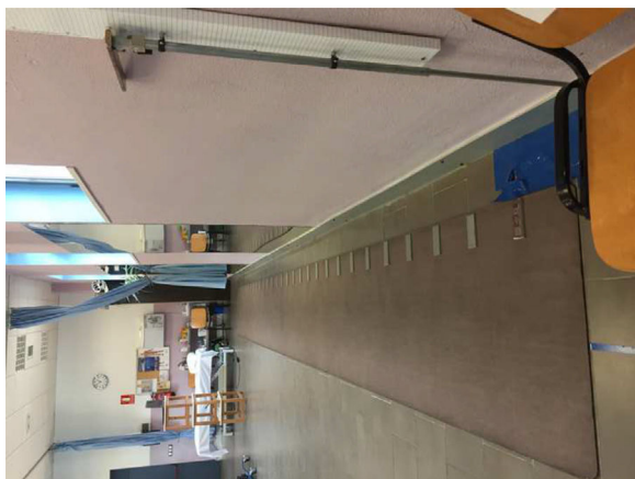
Figure 2 GAITrite® Electronic Walkway system.