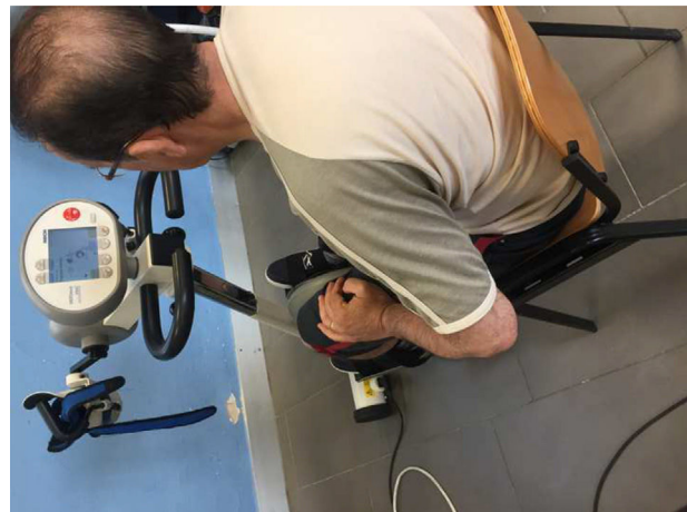
Figure 1 MOTomed Viva2 Movement Trainer ® system.

The research protocol was reviewed and approved by our hospital's research ethics committee (C.P.-C.I. 1896). All participants gave written informed consent to be included in the study.