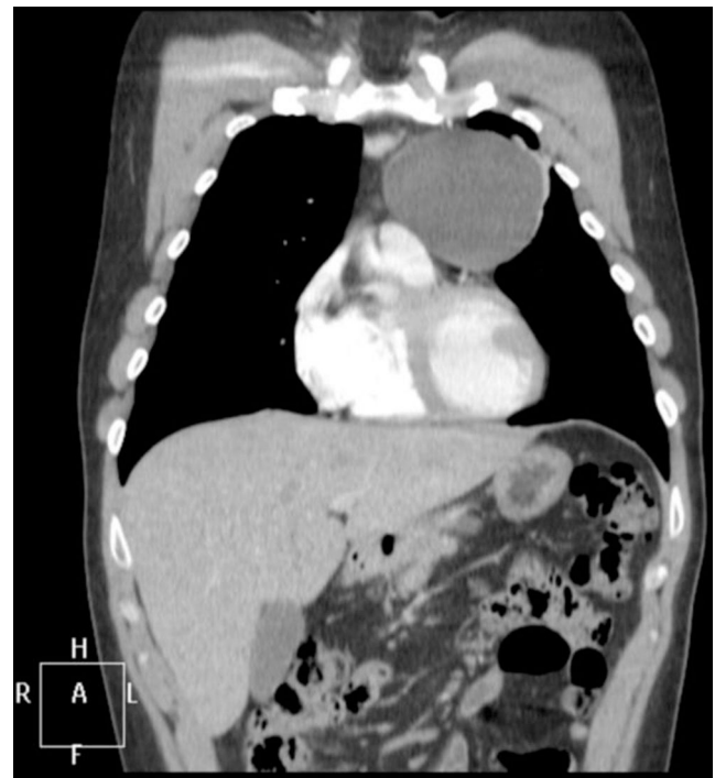
Figure 1 Chest CT scan. The mass in the anterior mediastinum is compatible with thymic cyst.

Following diagnosis, the patient was started on treatment with pyridostigmine dosed at 60 mg every 8 hours. This partially improved the ptosis and the strength of the orbicularis oris muscle. One month later, the patient started a slow tapering course of prednisone, beginning at a weight-adjusted dose of 80 mg/48 hours. In the second month