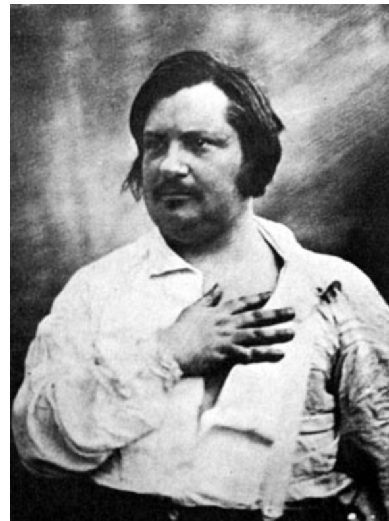
Figure 1 Honoré de Balzac

The purpose of this study is to highlight Honoré de Balzac's interest in human gait, which can be observed in the descriptions of many of his characters as well as in his Theory of Walking .