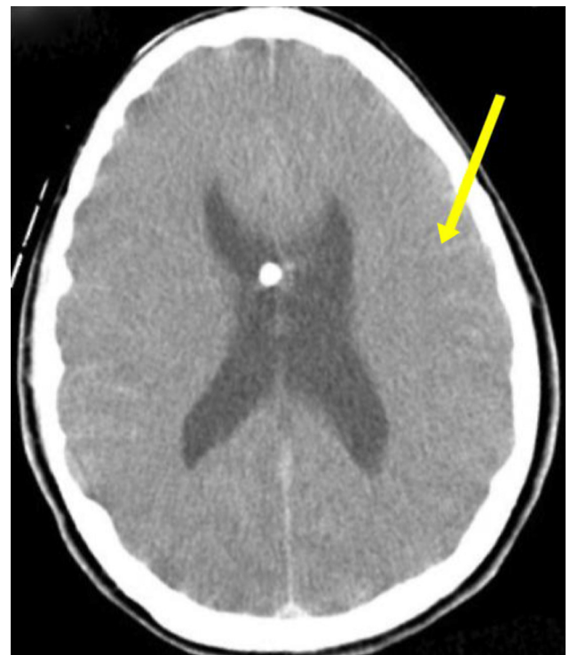
Figure 3 Cranial computed tomography after the endoscopic third ventriculostomy that revealed subarachnoid haemorrhage on the cortical convexity sulci (arrow).