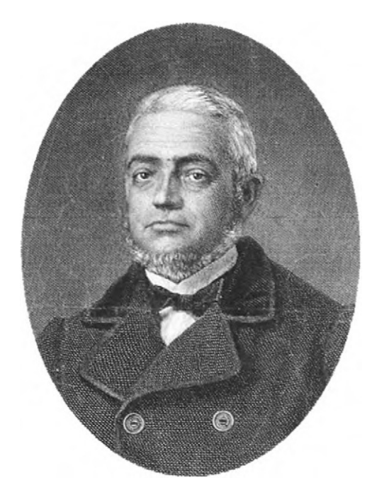
Figure 2 Pedro González Velasco (1815—1882).

epileptics and idiots, we often witness endearing scenes; mothers whose love for their children surpasses the horror of their disease visit and bring their beloved offspring sweets and toys that must have cost a full week's savings [...]. When the hubbub of the day has died down, and when the sounds of the city grow quiet around this house of rest and suffering, the on-call intern, summoned to an unfortunate patient's bedside, might imagine himself in a vast necropolis, whose silence is periodically shaken by the shrill, wild cries from the quarters for the madwomen and epileptics. But what difference does it make, for he is a doctor exercising his office''.