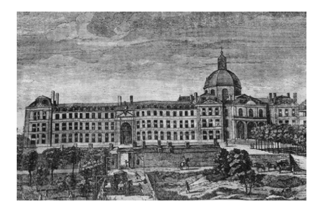
Figure 1 La Salpêtrière in 1760 in an engraving by Regaud.

One might imagine that when Charcot began working in La Salpêtrière, he was faced with a chaotic holding pen filled with chronically ill patients who survived in woefully precarious conditions. However, this is not exactly the case. It is true that in the 17th and 18th centuries, the massive hospital complex housed between 6000 and 8000 residents. It served as something between a charitable institution and a correctional centre. Its residents, all female, included beggars, the elderly, the blind, orphans, epileptics, the mentally