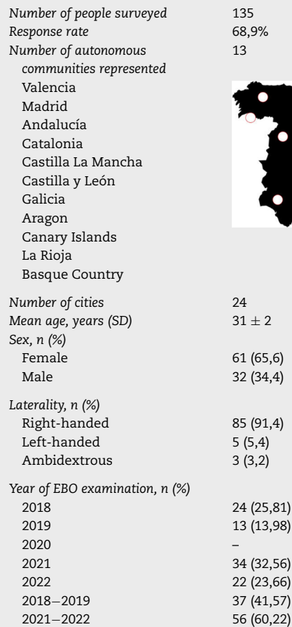
Table 1 – Demographic characteristics of study participants.

This table is an overview of the demographic characteristics of the Spanish sample participants. It includes representatives from 24 cities in 13 of the 17 autonomous regions. Three cities from three communities (Valencia, Madrid and Barcelona) account for 64.5% of the sample studied. The typical participant is a 31-year-old right-handed woman who passed the exam between 2021 and 2022.