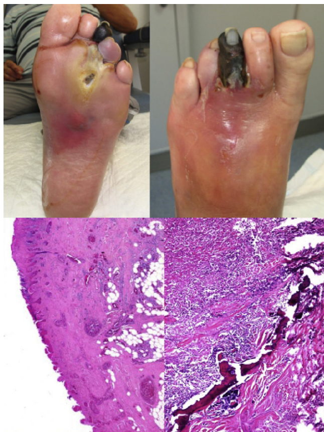
Figure 1 Upper images: top left, plantar view of foot showing an ulcer on the head of the 3rd metatarsal, with marked perilesional reddening and a necrotic 3rd toe. Ulcer was exposed after delamination of the surrounding hyperkeratosis, which is typical in neuropathic lesions. Top right, dorsal view of foot showing reddening of midfoot and 3rd toe necrosis. Lower images: bottom left, blood vessel congestion and dilation, as well as granulation tissue. Ulceration and a necrotic appearance of epidermis and dermis are also seen. Bottom right, intensive, predominantly eosinophilic inflammatory infiltrate with eosinophils involving bone tissue.

insensitive foot (which is therefore at risk), combined with an absence of pain, usually prevent patients from seeking the help of a healthcare professional until more advanced stages. If we add to this the occasional lack of adequate expertise of some of the professionals in charge of these patients, the result may be a more severe and infected lesion. The presence of pulses ruled out ischemia as the cause of the lesion, and concomitant necrosis suggested a serious infection, even in the absence of signs of systemic impact such as fever, hyperglycemia, leukocytosis and/or an increased erythrocyte sedimentation rate, which is typically found in diabetic patients when infection exists, but may sometimes be absent when a foot is affected. 8 In an infected ulcer, a positive probe-to-bone test normally leads us to suspect bone involvement, 9 as it was confirmed in this case by the histological study. The isolation of MRSA is relatively common in these infections and may partly account for lesion severity and aggressiveness and for the lack of an initial response to empirical antibiotic therapy.