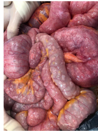
Fig. 2 – Intestinal loops with abundant wall pneumatosis.

A 77-year-old woman with a history of surgery due to intestinal obstruction caused by an adhesion band came to the emergency room due to progressive abdominal pain and constipation over the previous 24 h. Abdominal computed tomography showed considerable pneumoperitoneum and fluid, suggestive of a perforation with generalized peritonitis and pneumatosis in the descending colon and small intestine, with no signs of intestinal ischemia (Fig. 1), which was resected (Fig. 2). We reviewed the entire intestinal package but found no interruption or signs of ischemia. The patient presented no postoperative complications.