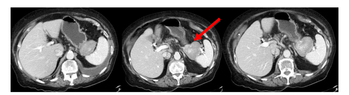
Figure 1 - A) Abdominal CT with intravenous contrast showing periduodenal collection and intra-abdominal free fluid. The

stomach and the splenic hilum, which it displaced without infiltrating. The lesion presented small satellite and periceliac lymphadenopathies. The findings indicated a possible stromal tumor (GIST) without ruling out association with the pancreas (Fig. 1). Endoscopic ultrasound-guided fine-needle aspiration provided evidence of lymphoid tissue with aggregates of epithelioid histiocytes, CD68+ and negative GIST markers (chronic inflammatory reaction with non-caseating histiocytic granulomas). Given the uncertain diagnosis, the patient's symptoms and the impossibility to rule out malignancy, we decided to operate after presenting the case to a multidisciplinary committee. The initial laparoscopic approach was converted to a bilateral subcostal laparotomy due to hemodynamic instability and episodes of sustained ventricular tachycardia. We observed diffuse retroperitoneal granulomatous infiltrate and 3.5 L of ascites. Intraoperative peritoneal biopsies were negative for malignancy and reported as fibroconnective tissue with chronic inflammation, lymphoid and presence of granulomas with multinucleated giant cells. Distal pancreatectomy and splenectomy were performed.