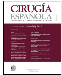
Image of the month