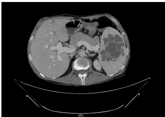
Fig. 1 – Preoperative CT scan.

Although in recent years the use of imaging-guided fine-needle aspiration biopsies has increased in a large variety of benign and malignant splenic lesions, 3 there are authors who consider it a contraindication due to the risk of bleeding and the limited amount of tissue for correct diagnosis. 2