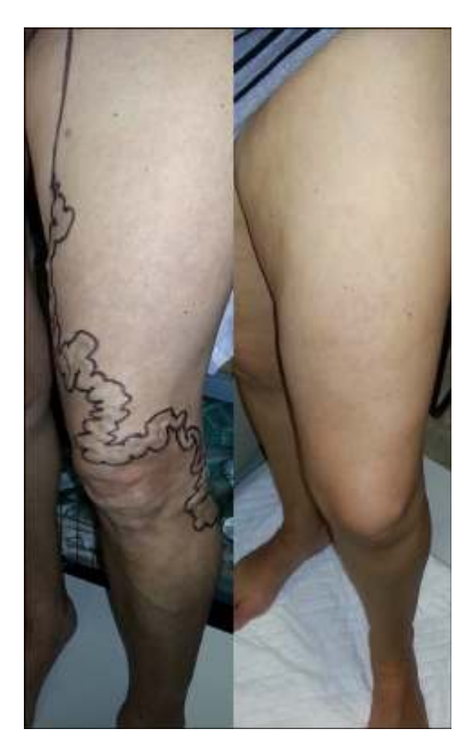
Fig. 2 – One-year results after surgery: image showing varicose tributaries of the AASV; the left image shows the preoperative mapping, and situation 12 months after surgery is on the right.

Three (5%) haematomas were detected, none of which required surgical treatment. There were no deaths, hospitalisations, deep venous or symptomatic superficial thromboses, infections or episodes of neuritis. Early ultrasound tests detected 7 (11%)