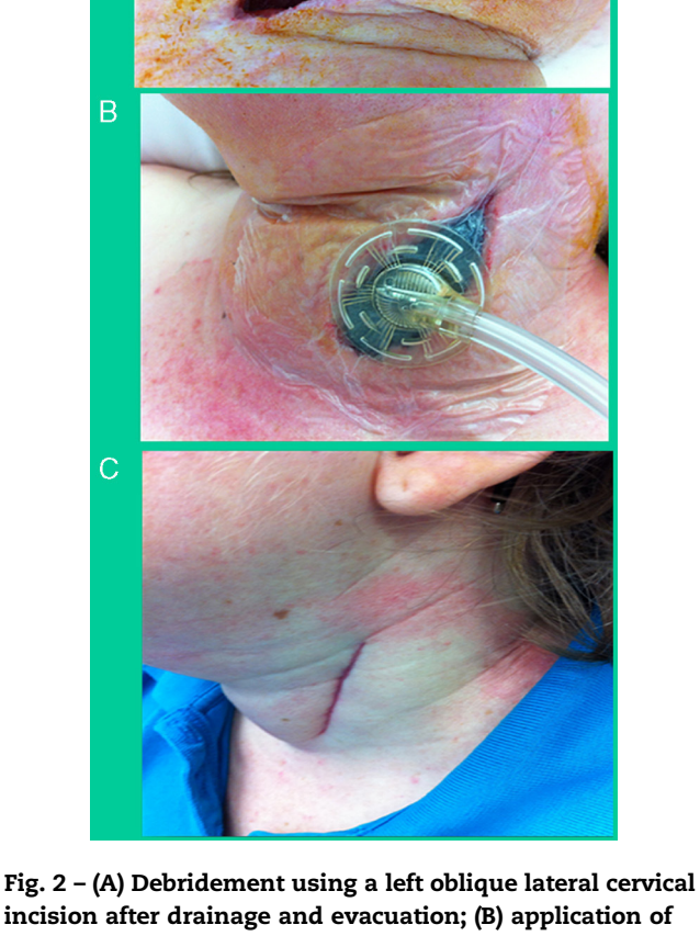
Fig. 2 – (A) Debridgement using a left oblique lateral cervical incision after drainage and evacuation; (B) application of vacuum-assisted closure therapy at the site of the cervical debridgement, mid-way through treatment (day 7); (C) results 27 days after discharge and 3 months after hospital admittance.

Agranulocytosis associated with metamizole is rare but potentially fatal, supposedly determined by genetic immunological factors. There are geographical differences in incidence