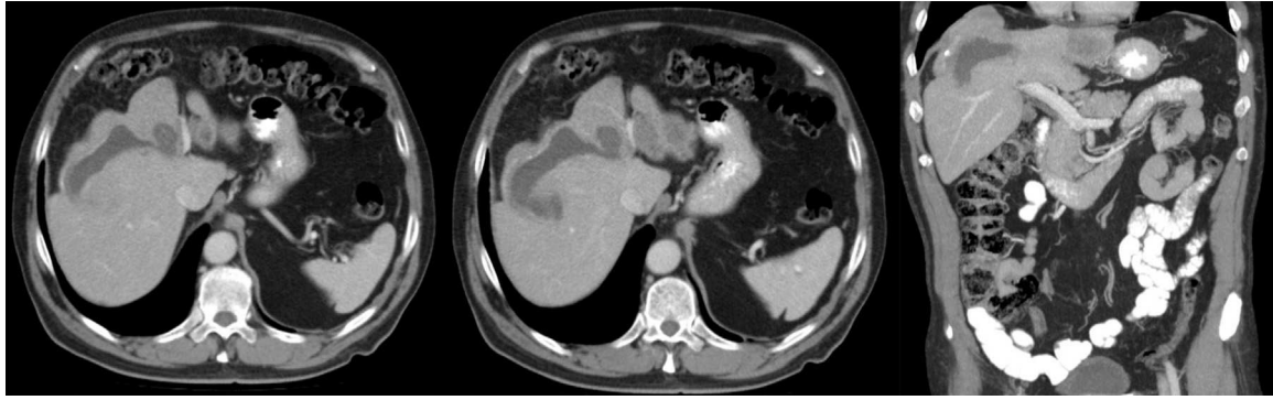
Fig. 2 – Patient from Fig. 1, 12 months after the PAIR technique.

The benefits of PAIR include: diagnostic confirmation, elimination of parasitic material, low morbidity and almost no mortality, shorter hospitalization and lower cost than surgical techniques. 3,5,8,9 The complications described are typical of any liver puncture (bleeding), while others are specific to PAIR: biliary fistula after cystic decompression, sclerosing cholangitis if there is passage of scolicalidal solution to the bile duct, cyst infection, parasitic dissemination, systemic toxicity from the injected liquid and anaphylactic reactions. 5,9 In cysts larger than 10 cm, it is recommended to always leave in a drain tube for 48 h. 5