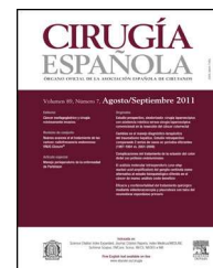
Image of the month