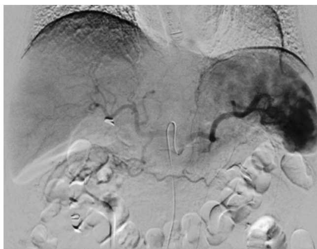
Fig. 2 – Selective arteriographies from the left gastric and celiac trunk; the left gastric artery is selectively catheterized, verifying the selective uptake of the tumor, covering the entire lesser curvature.