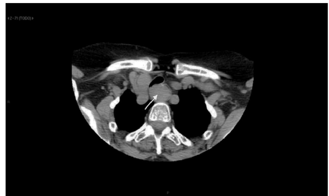
Fig. 1 – Cervicothoracic computed tomography: lesion in the cervical esophagus that practically closes the esophageal lumen.

With the findings from the EUS and PET-CT, the probable diagnosis of leiomyoma was established. Although the patient reported no digestive symptoms, we decided to operate because of the uncertain exact nature of the lesion and its possible subsequent evolution. We used a left lateral cervical approach, which is the usual approach to the cervical esophagus in our department, and the mass was identified in the esophageal wall. After longitudinal myotomy, the lesion was observed to be benign in appearance, lobulated, dark blue in color and soft in consistency, which are characteristics compatible with hemangioma. We decided to perform an enucleation of the mass. It was closely adhered to the mucous membrane, which we opened in order to complete the separation from the mucosa without rupturing the tumor.