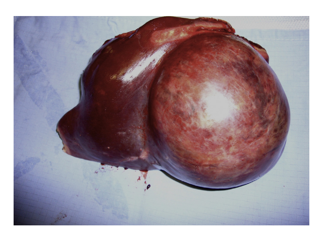
Fig. 1 – 11 cm hepatic adenoma with intra-tumoral bleeding in the left lateral sector.

Surgery was elective in 90% of cases (73/81). The 7 emergency operations were performed on complicated HA (rupture/haemorrhage); the eighth patient with haemorrhage was embolised and underwent elective surgery. The techniques used were: major hepatectomy (22%), minor hepatectomy (77%) and a liver transplant after prior resection as new lesions had appeared (right-sided hepatectomy). 20% of the operations were performed using a laparoscopic approach. Morbidity was 28% (n=23). The morbidity was divided into two groups according to severity: Clavien I–II: 82% (n=19) and major Clavien: III–IV: 18% (n=4). There was no mortality. In the histological study, 2 patients presented malignisation of