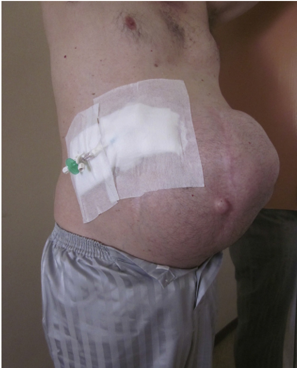
Fig. 1 – Patient with a large incisional hernia and loss of domain, before the intervention.

authorizing the pneumoperitoneum procedure and intervention. Immediately after the initial insertion of the catheter, the first dose of room air was injected through a device with a bacterial filter that was used daily for insufflation (double-lumen catheter similar to the one used in central lines).