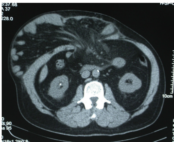
Fig. 2 – Computed tomography axial cut showing more than 50% of the abdominal content outside the abdomen in the hernial sac.

In 6 patients, the insufflation catheter was inserted in the operating room. The other 5 patients underwent ultrasound- or CT-guided catheter placement. We performed an initial