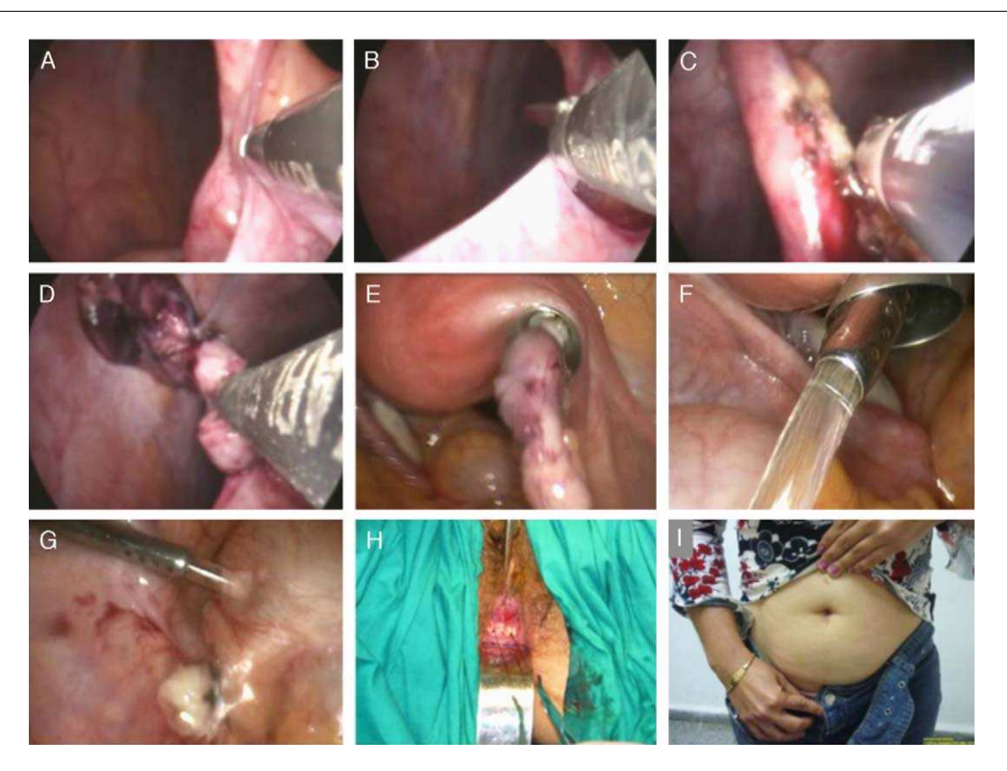
Fig. 3 – (A) and (B) Release of adhesions; (C) electrocoagulation of the mesoappendix; (D) amputation of the caecal appendix; (E) removal of the organ inside the vaginal trocar cannula; (F)–(G) irrigation and aspiration of the region; (H) colpotomy closure; (I) aesthetic result of the intervention.

diagnosis and for minor surgical procedures. In the 1970s it fell out of favour with gynaecologists who preferred laparoscopy.<sup>16</sup>