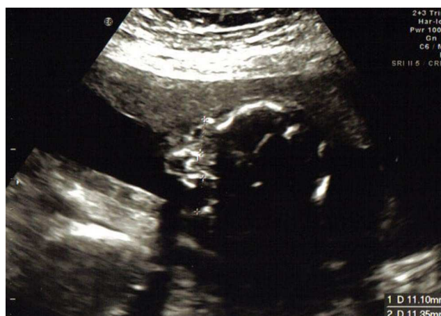
Fig. 2 – Obstetric ultrasound at 20 weeks; asymmetry of foetal ocular globes.

In the second trimester, first at 20 and later at 23 weeks, the morphologic ultrasonography revealed an asymmetry of ocular globes (Figures 1 and 2), with a small diameter in the left orbit with a total axial length of 8 mm (Figures 3 and 4). This