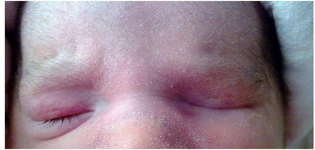
Fig. 5 – Newborn with left palpebral closure.

the prenatal supposed: left palpebral closure with absence of ocular globe, and opacification of cornea and microphthalmia in the right eye. An ophthalmologic evaluation was done in neonatal period, confirming total visual impairment. An oculoplastic surgeon evaluation was also performed, in order to analyse prosthetic intervention and surgery. The child remains in surveillance in paediatric and ophthalmologic consultation, without any surgical intervention until now.