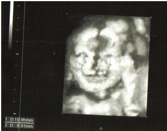
Fig. 3 – 3D ultrasound at 23 weeks; asymmetry of foetal ocular globes.

study was complemented with foetal magnetic resonance that confirmed a severe left microphthalmia, with difficult in observation of optic nerve integrity.