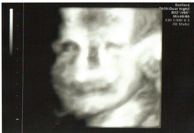
Fig. 4 – 3D ultrasound at 23 weeks; asymmetry of foetal ocular globes.

The first physical examination confirmed ocular congenital malformation (Figure 5), that was not coincident with