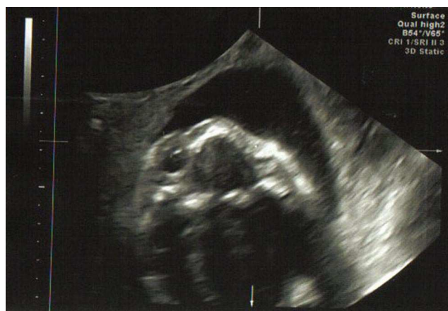
Fig. 1 – Obstetric ultrasound at 20 weeks; asymmetry of foetal ocular globes.

The first trimester exams were normal, including the 12th week ultrasound. Because of the age and maternal anxiety, the expectant performed amniocentesis at 15th week, for cytogenetic study, that revealed a normal cariotipo: 46,XX.