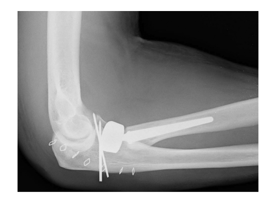
Fig. 4 Fracture of the radial head treated with bipolar prosthesis. Reconstruction of the coronoids with Kirschner needles.

Fig. 2 Example of Tornier<sup>®</sup> type bipolar radial head arthroplasty. Note an attachment for the reinsertion of the lateral collateral ligament complex. (LCL).