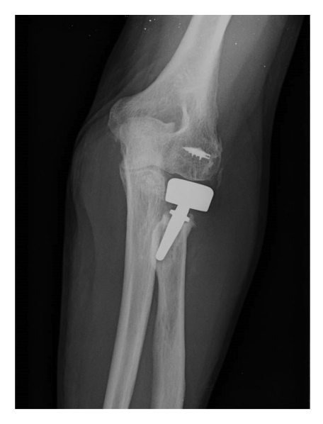
Fig. 2 Example of Tornier<sup>®</sup> type bipolar radial head arthroplasty. Note an attachment for the reinsertion of the lateral collateral ligament complex. (LCL).